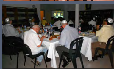
Farbrengen at the Yeshivah of DRC.